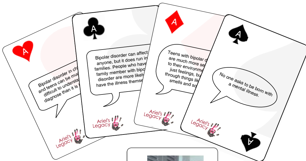
A sample of ARIEL'S LEGACY C.U.E. Campaign playing cards (CUEcards)

Some design samples of the 2010 "Have a Heart" Campaign, CANFAR, Canada, for HIV/Aids awareness are provided on the following page in order to show the potential for the C.U.E. Campaign posters.